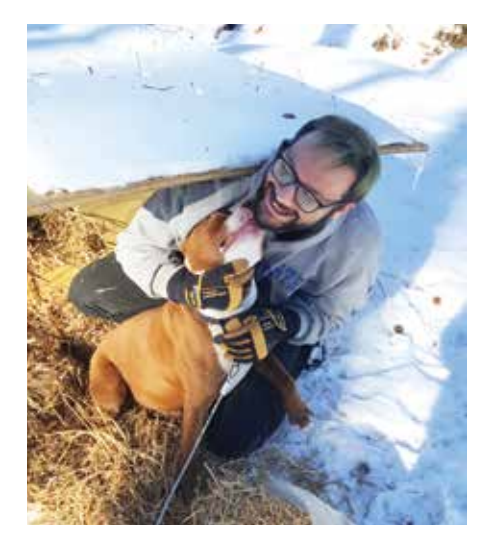
Bentley and hundreds of other "outdoor dogs" got free straw doghouse bedding to help protect them against frigid temperatures.

These puppies , found running loose by PETA staffers who were in the field helping animals during the "bomb cyclone" that covered Virginia with up to 10 inches of snow, were among 125 animals given to PETA and transferred to other Virginia shelters for adoption . We also spayed their mom, Brownie .