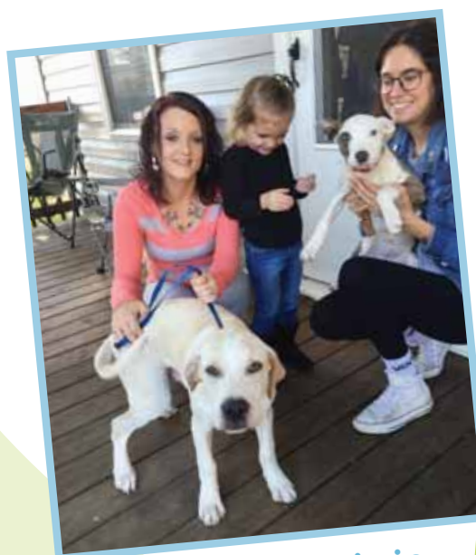
Chico and Trixie