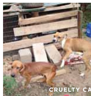
CRUELTY CASE SURVIVORS