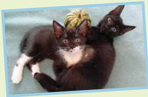
Buffy and Willow